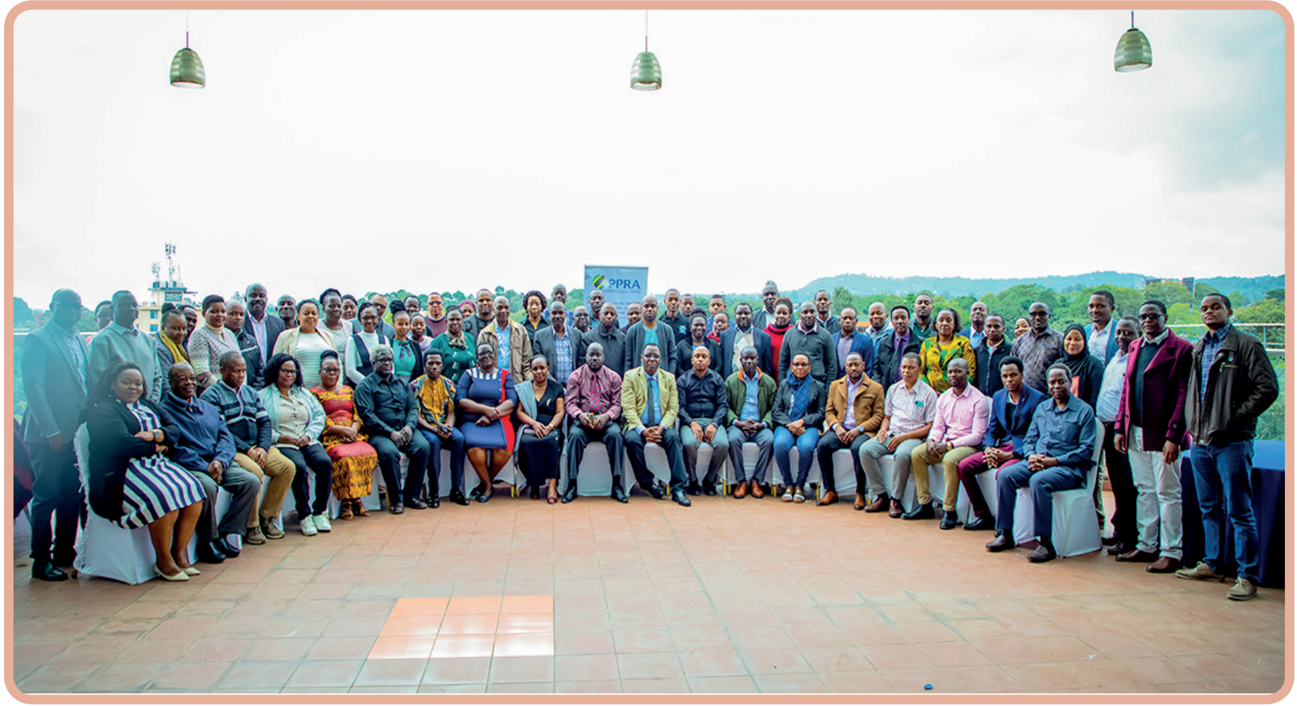
PPRA facilitators and participants during training on Public Procurement Act and TANePS, which was held in Arusha from 14 to 17 June, 2022. Participants were members of tender boards, legal officers, staff from procurement management units and user departments of various procuring entities.